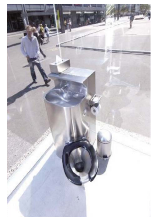
WC – view from inside